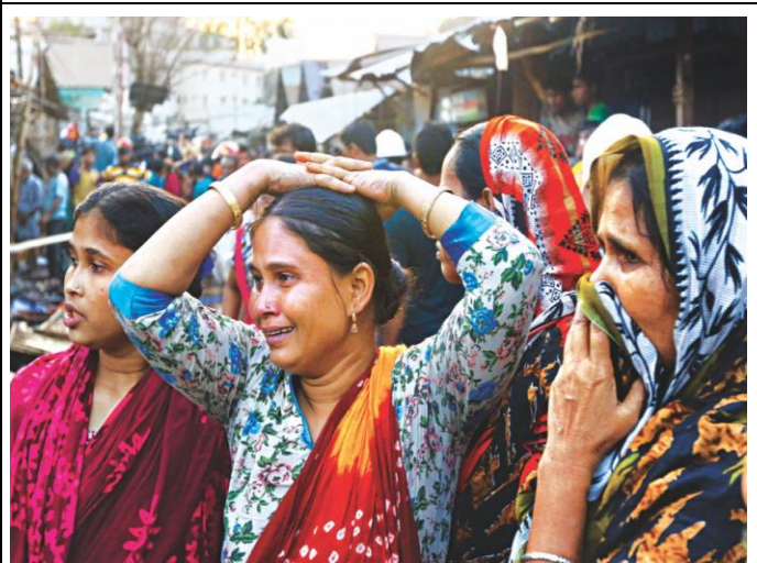
Helpless people who lost everything