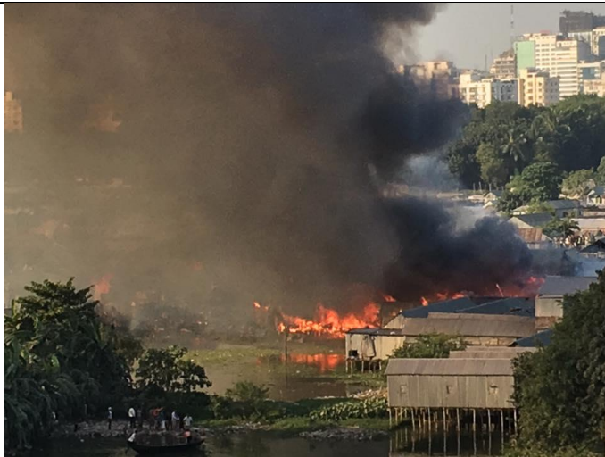
Smokes and fire