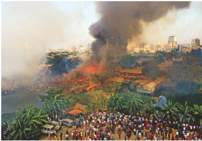
Smoke billows from Korail slum