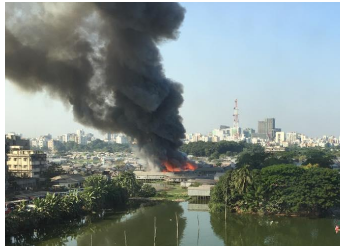
Smoke billows from Korail slum