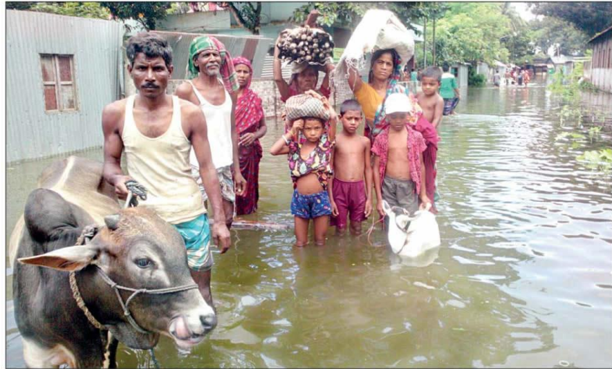
Photo: People including women and children are moving for a safe place, Chukainagar Union, Dewnganj, Jamalpur

In public domain, roads, culverts, embankment have been damaged in many